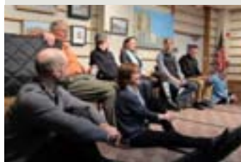
Actors gather for a post-show talk-back with the audience.

Saturday, October 19, 1:45 introduction, 2:00 performance